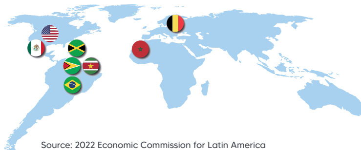
Source: 2022 Economic Commission for Latin America and the Caribbean (ECLAC) Report

US, Belgium, Morocco, Guyana, Mexico, Brazil, Jamaica and Suriname.